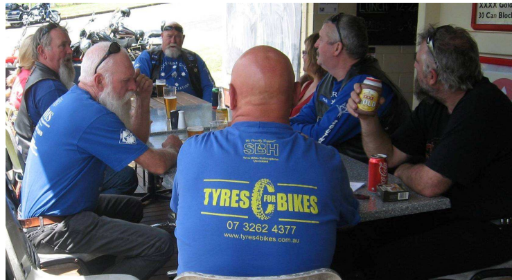
South east SCA members enjoy the ride to Kandanga

In the last SCA news letter it was advised that there was to be a meeting of any interested members at Boreen Point to find out if there was interest in forming a new branch. There was a good showing of members and our inaugural meeting was held on the 1 August.