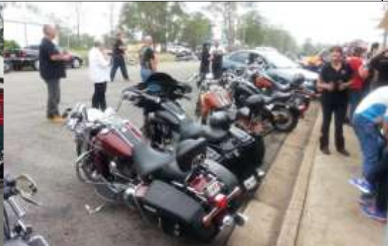
First stop Gunalda