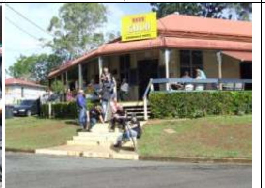
Third stop Kandanga