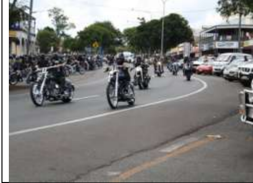
And they're off – Pigs Arse Rally