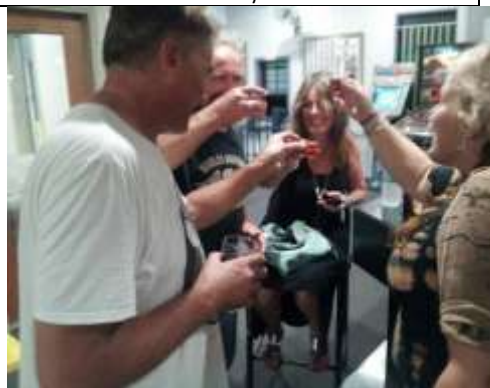
A few shots and that was the end!!!