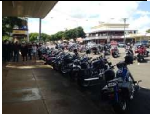
Pigs Arse Rally Childers