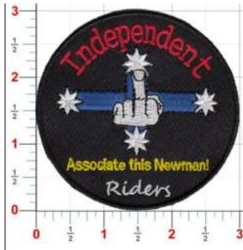
This cloth patch now available $6.00