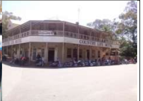
Kin Kin Country Life Hotel