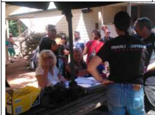
Second stop Kin Kin