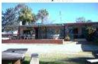
Mt Perry Hotel