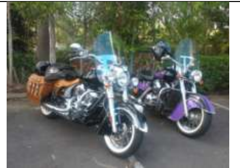
Indian and Drifter Poker Run 2014