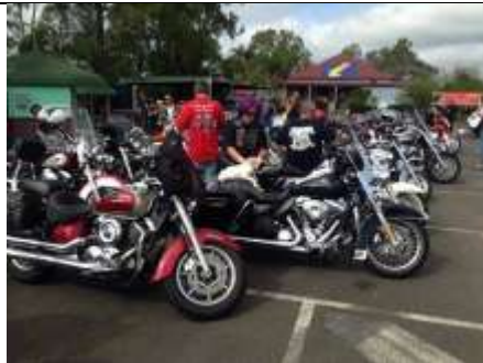
Nel and pup start of Poker Run 2014