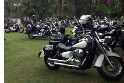
Borreen Point with Shadow Riders