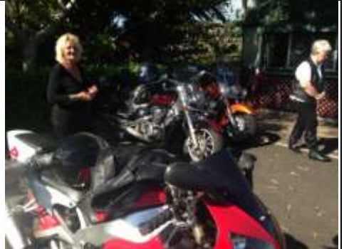
New friends ANZAC Day Ride