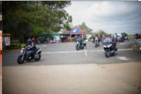
And.. They are off..