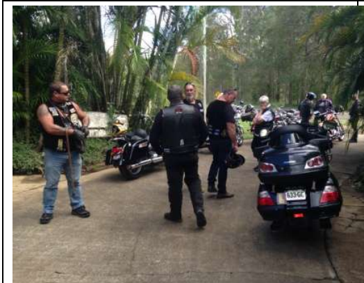
No beer. ANZAC Day Ride ☹️