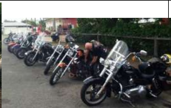
Gunalda - ANZAC Day Ride