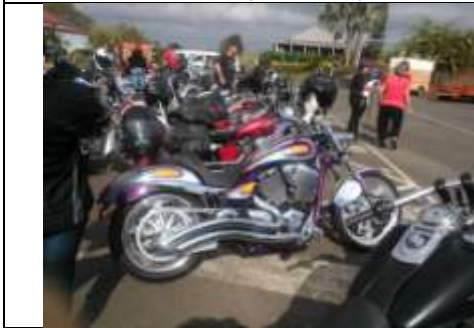
Start of Independent Poker Run 2014