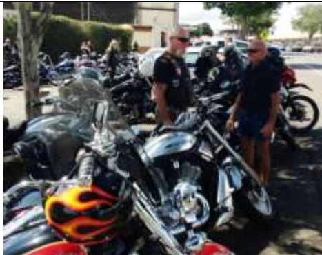
Registering Pigs Arse Rally Federal Hotel Childers