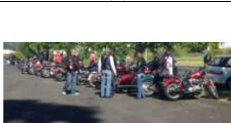
Yep another Boonah shot!!!