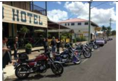
Catching up at The Grand - Bucca Run