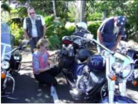
Stan's Indian - Kandanga Ride

Rides/Events Attended Independents February 2015