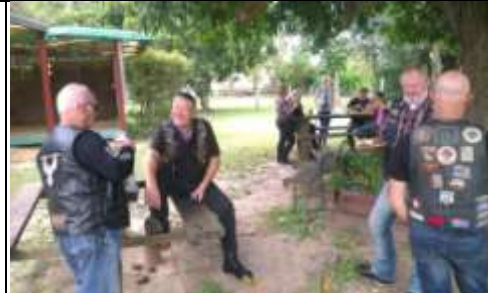
New Friends - Bucca