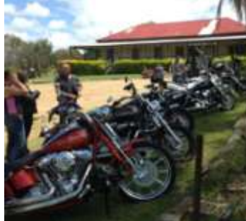
Lunch stop at Bucca