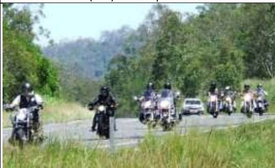
Independent Riders - North of Gympie