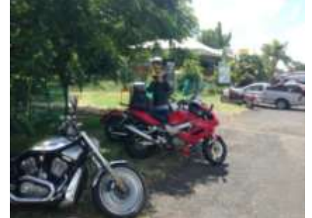
Music and beer at Apple Tree Creek