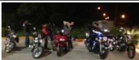
REGISTRATION SUNRISE RUN - BRIBIE