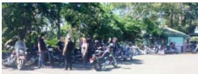
Puma South Maryborough - Kandanga Day Ride. February 2014