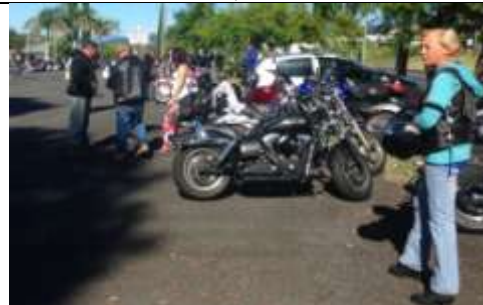
Last stop Boonah - Breakfast!!!