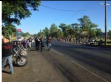
Bikes meeting up at Fernvale