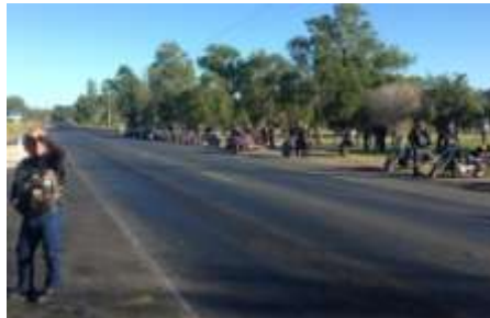
2nd stop Fernvale