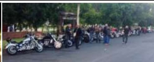
PARKED UP AT KILCOY - SUNRISE RUN