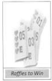
Raffles to Win