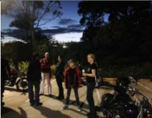
Sunrise almost ready to head