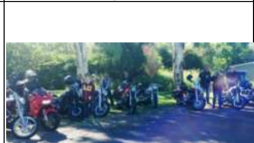
Parking up (shade) Boonah