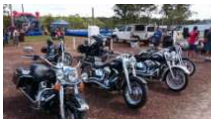
1, 2 and 3 = Cars and bikes at Conrodders Campout / Show and Shine