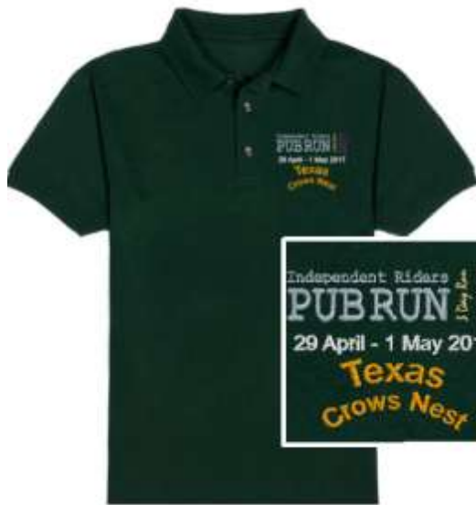
Pub Run 2017 Polo Embroidered Shirts $35