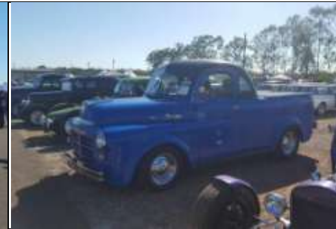
Conrodders Show and Shine/Campout