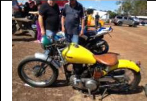
An oldie but a goody - Conrodders Campout