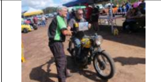
Some of the winners - Conrodders Campout