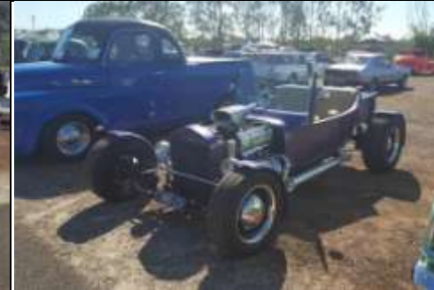
Conrodders Show and Shine/Campout