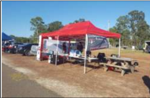
MACE/Independent tent - Conrodders Campout