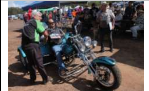
Some of the winners - Conrodders Campout