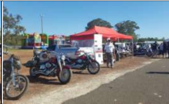
MACE/Independent tent - Conrodders Campout