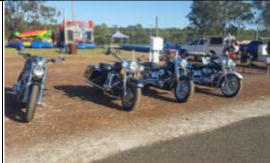
Some of the bikes - Conrodders Campout