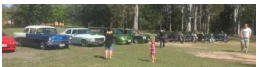
1 st At joint car bike ride Maryborough 2 nd Teddington Weir = Joint car/bike event