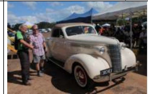
Some of the winners - Conrodders Campout