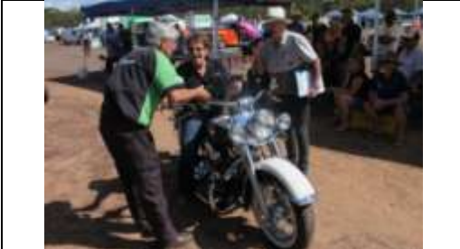
Some of the winners - Conrodders Campout