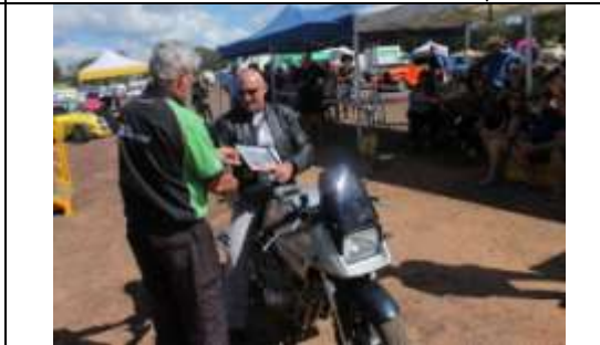
Some of the winners - Conrodders Campout