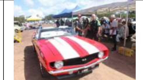
Some of the winners - Conrodders Campout