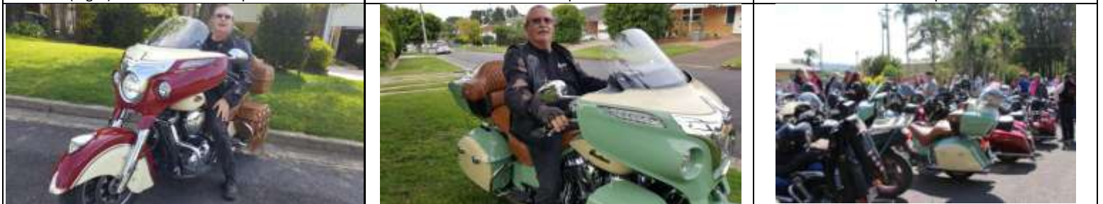
Batman - Moreton Bay trying out new Indians #1