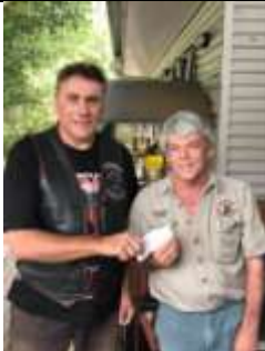
Ray - Wildlife Sanctuary receives 1st Toy Run cheque