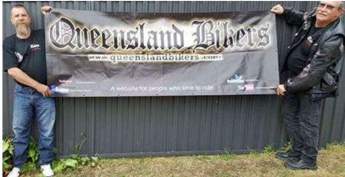
BELOW: CLOTH FLAG (Sample) 1.5 x 1 METRE APPROX