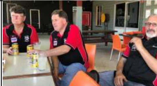
Conrodders at Gunalda