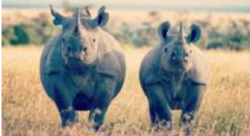
What an adorable border cauli

RHINOS ARE JUST UNICORNS THAT HAVE LET THEMSELVES GO.