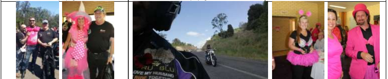
Bras and Bikes - 2017 #2