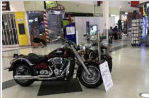
Bikes on display Toy Run Stall 13/10/2017