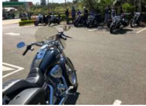
Meeting up at Puma South Maryborough #2