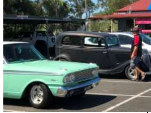
Conrodders arrive at Puma South