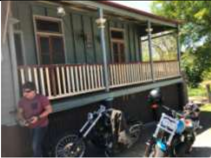
Beer stop at Gunalda