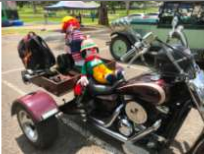
Donated Toys - RACQ Life Flight Event