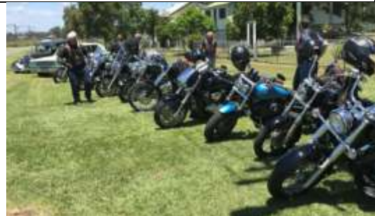
Parked up at Theebine