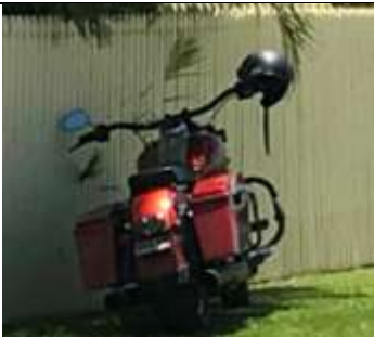
Pete's Bagger at Theebine