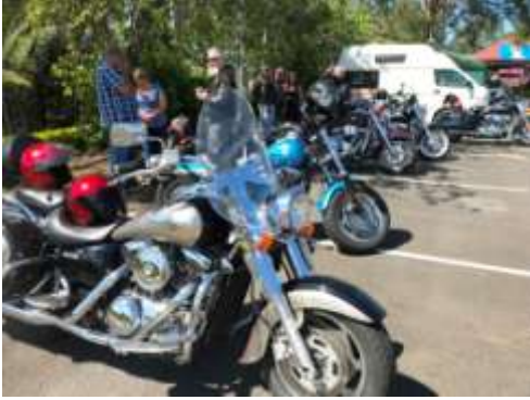
Meeting up at Puma South Maryborough #1