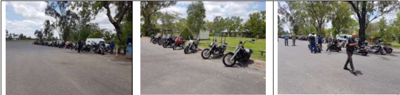
Lost Mates Ride Capricorn Coast #1