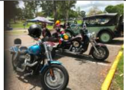
Independent Riders and MACE at RACQ Life Flight