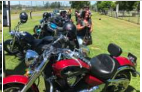
Lunch stop at Theebine