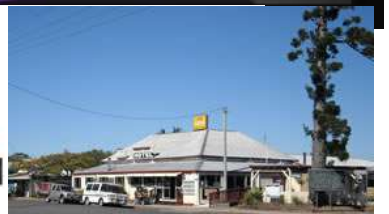
The Aussie Hotel— Corner Alice & Adelaide Streets Maryborough