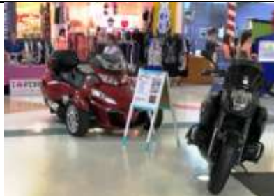
Bikes on display Toy Run Stall 26/10/2017