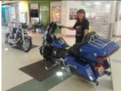
Bikes on display Toy Run Stall 20/10/2017