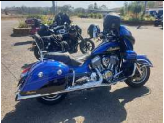
K Gililands Kids Charity Ride #5