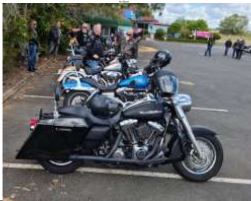
Day ride to Hell Town and Noosa Nort Shore

Out and about on the Fraser Coast – October 2020