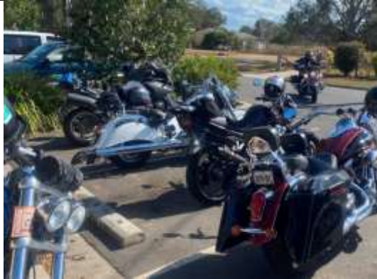
Beer time at Gunalda