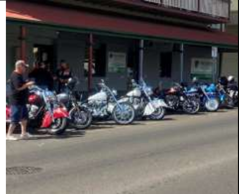
Starting ride – Bush Tales Café in Lennox St