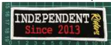
Rider Patches 2013-2020