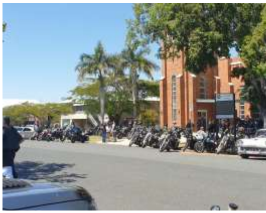
K Gililands Kids Charity Ride #2