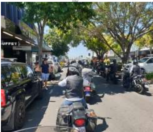
K Gililands Kids Charity Ride #1