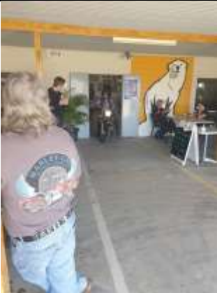
K Gililands Kids Charity Ride #7