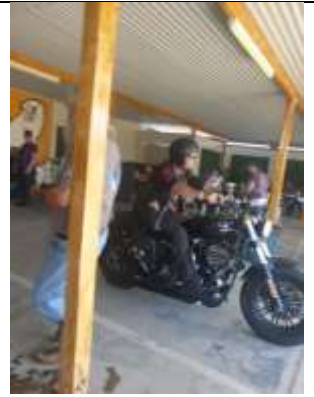
K Gililands Kids Charity Ride #6