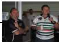
Darling Downs - Grimes Charity Run