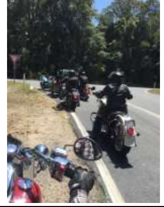
Lost? Never 😊 Near Borreen Point