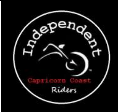
Independent Riders Capricorn Coast