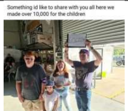
Results of the ride