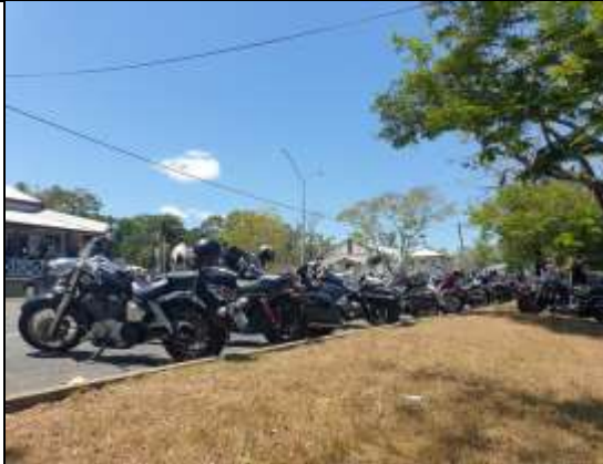
K Gililands Kids Charity Ride #8