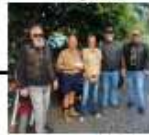
Chq presentation Fraser Coast Wildlife Sanctuary