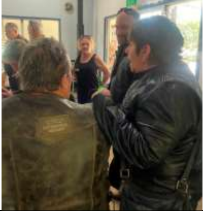
Somewhere where there is beer and rum 😊