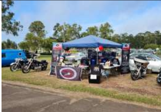
MACE stall M/Borough Showground