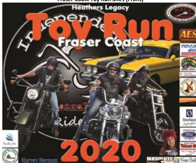
Fraser Coast Toy Run Shirt (Front)

The Fraser Coast Toy Run flyer can be seen in this edition of our Newsletter along with details/dates for toy run stalls at Station Square Maryborough and Hervey Bay, Stockland. TOY RUN TEE-SHIRTS ($25) AND PATCHES ($5) NOW AVAILABLE.