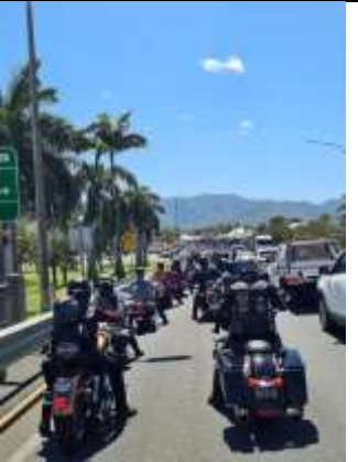
K Gililands Kids Charity Ride #9