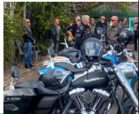
Meet up point Puma South