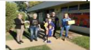
Moreton Bay Support Rural Schools

Independent Riders Australia – Supporting our communities