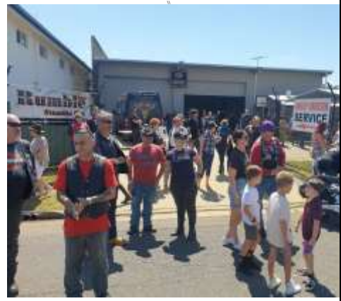
K Gililands Kids Charity Ride #3