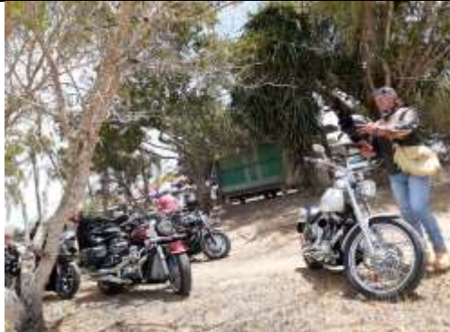
Parked up at Bucca