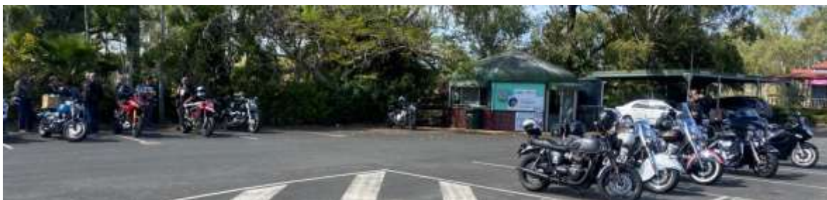
PIC #1 From Puma South – First October Day Ride