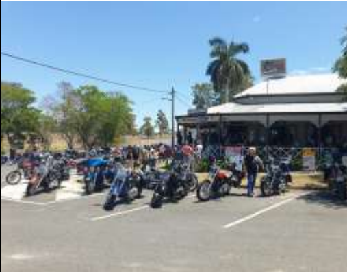
K Gililands Kids Charity Ride #4