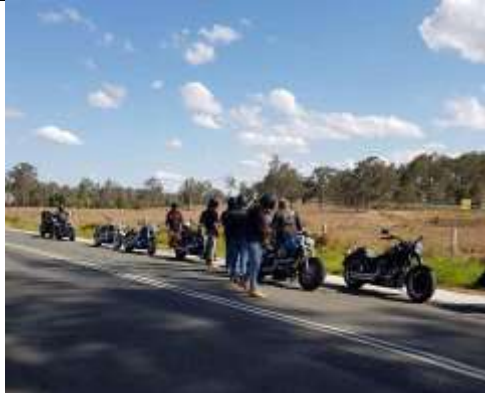
Regrouping near Gunalda