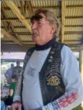
K Gililands Kids Charity Ride #10