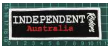
New Fraser Coast Patches $10 Each

Find us on the Web: www.eatmyshorts.com.au