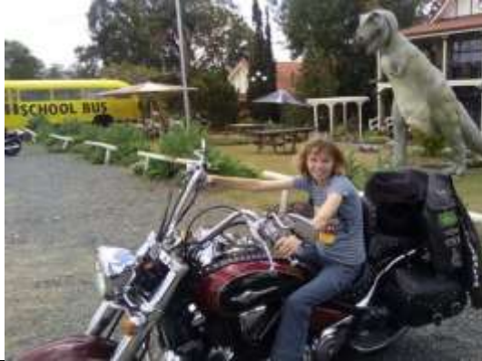
On dads bike at Hell Town