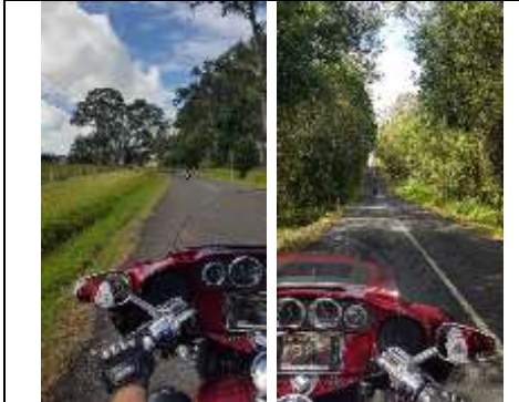
Out and about – 24 th April 2022 #9