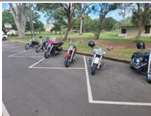
Out and about – 24 th April 2022 #4