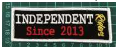
Rider Patches 2013-2020