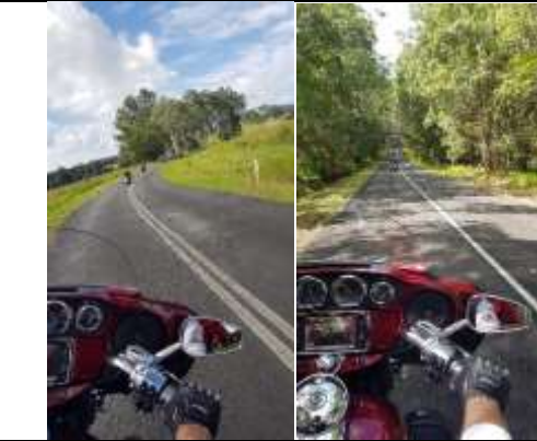
Out and about – 24 th April 2022 #7