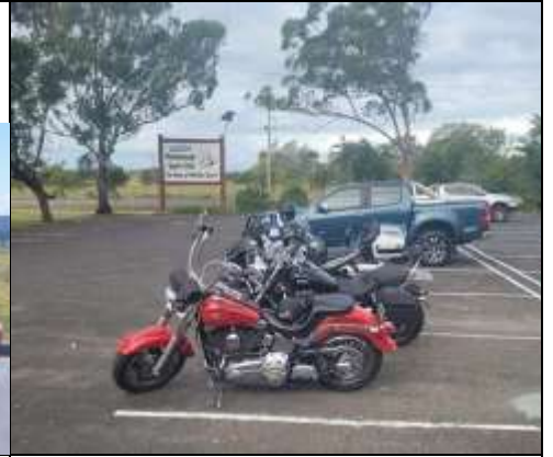
Out and about – 16 th April 2022 #3