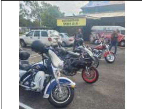
Out and about – 16 th April 2022 #4