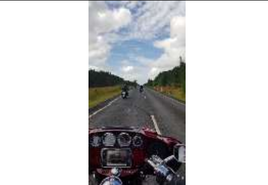
Out and about – 24 th April 2022 #10