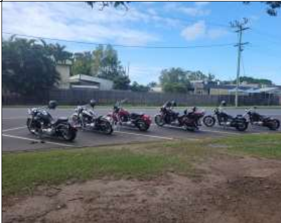
Out and about – 24 th April 2022 #1