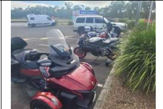
Out and about – 17 th April 2022 #1