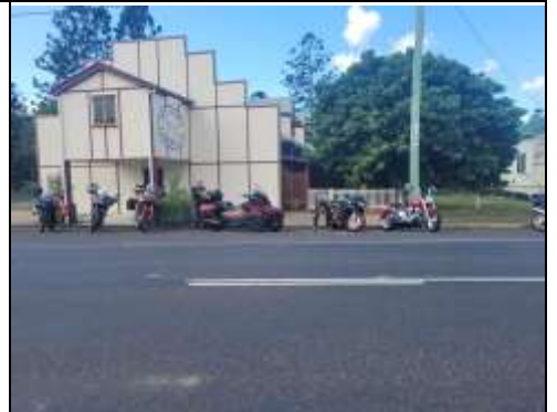
Out and about – 17 th April 2022 #5