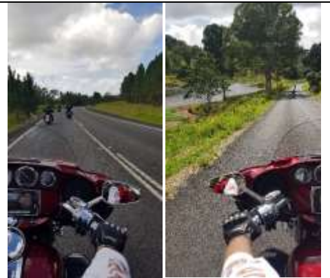
Out and about – 24 th April 2022 #5