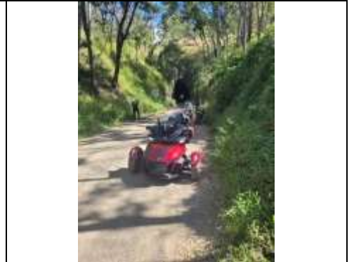
Out and about – 17 th April 2022 #2