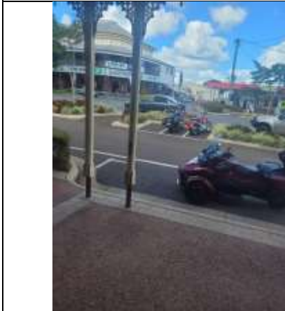
Beers at the Federal Childers