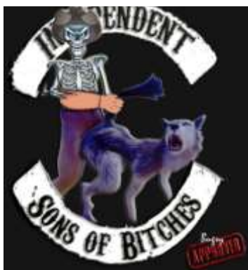
2022 Sons of Bitches Tee-Shirt Only $35.00