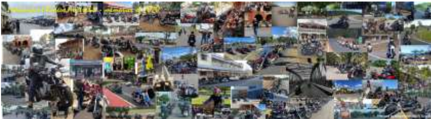
Banner example above 2.6x1 metre (approx.). $75 plus postage

Banners and Flags are Currently Unavailable