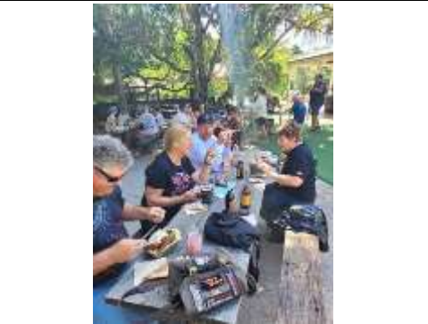
Out and about in April #1