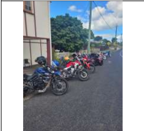
Out and about – 17 th April 2022 #6