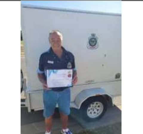
Thank you to RSL Hervey Bay Sub Branch