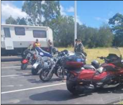
Out and about – 16 th April 2022 #1