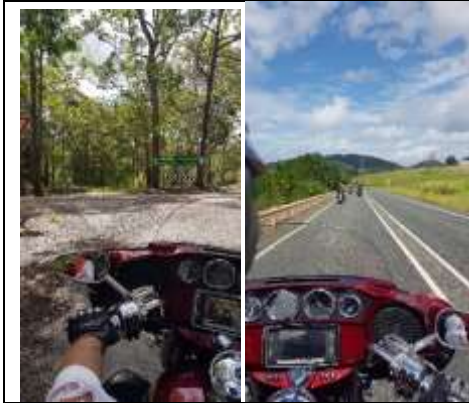
Out and about – 24 th April 2022 #6