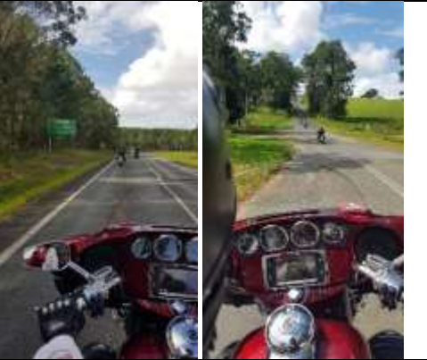
Out and about – 24 th April 2022 #8