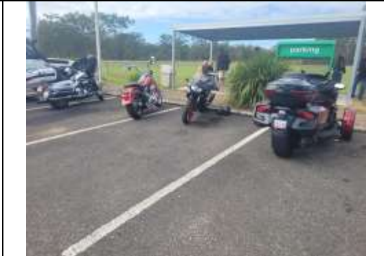
Out and about – 17 th April 2022 #4