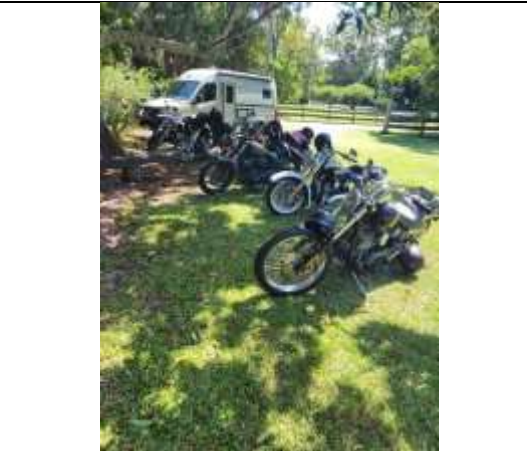
Out and about in April #2