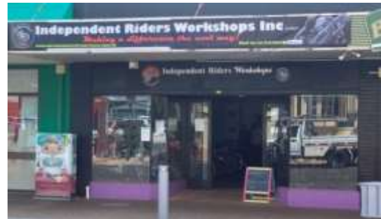
276 Kent Street Maryborough 4650