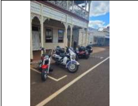
Out and about – 17 th April 2022 #3