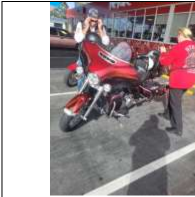
Out and about – 24 th April 2022 #3