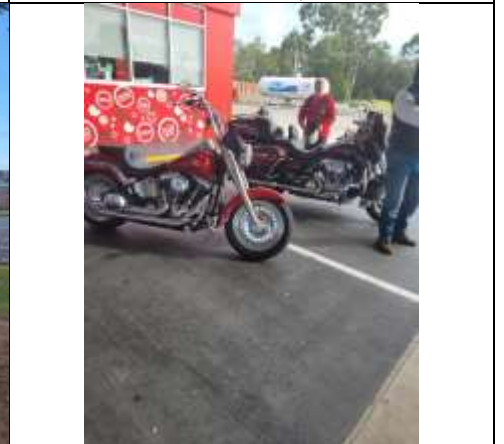
Out and about – 24 th April 2022 #2