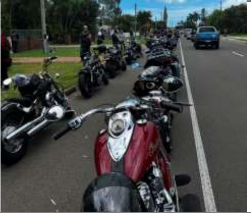
Regrouping at Tooth Street #1