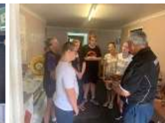
New Workshops and store front – 276 Kent Street Maryborough 4650

Many people on the Fraser Coast Region are struggling with reading, writing and maths. Independent Riders Workshops, offer literacy and numeracy classes, open to all ages including adults. We have a teacher who is available most days to run classes. Don't be shy, come in and give it a go. We are here for our community.