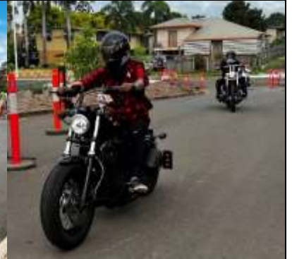
Fraser Coast Toy Run #2