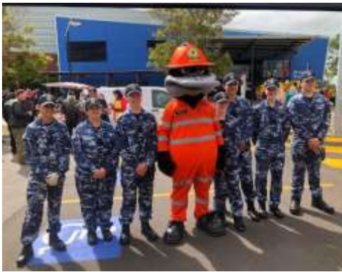
A few of our friends at the start of the toy run