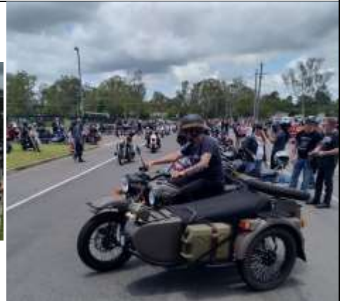
Last Stop Hervey Bay Sports Club #3