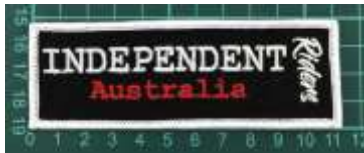
New Fraser Coast Patches $10 Each