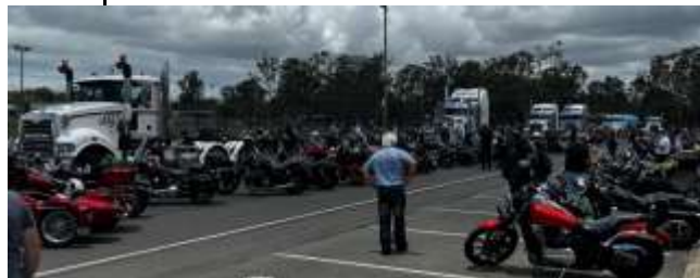
Last Stop Hervey Bay Sports Club #2