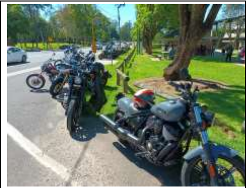
Cooloola/Sunshine Coast Toy Run 2021 #1