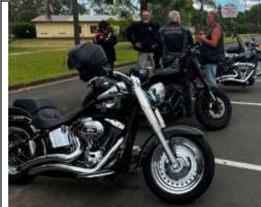
Day Ride 19 th December #1