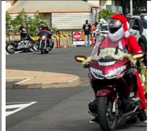
Fraser Coast Toy Run 2021 #3