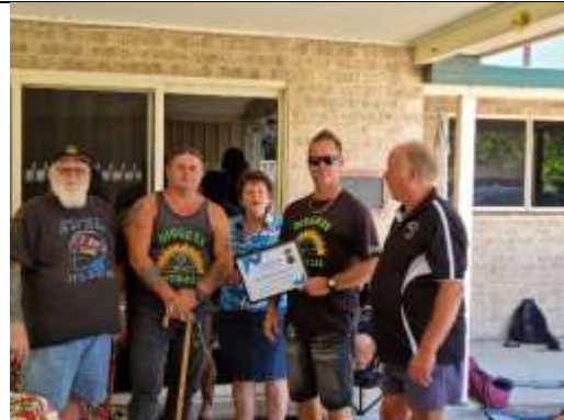
Thank you to Diggers at Ind/Riders Xmas Party