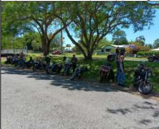
Cooloola/Sunshine Coast Toy Run 2021 #2