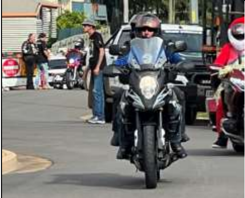
More bikes coming in – Fraser Coast Toy Run #1