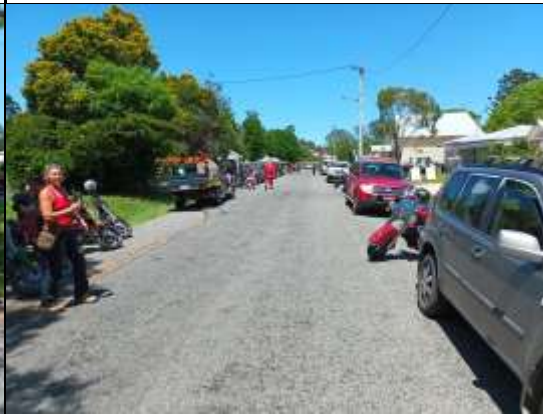
Cooloola/Sunshine Coast Toy Run 2021 #3