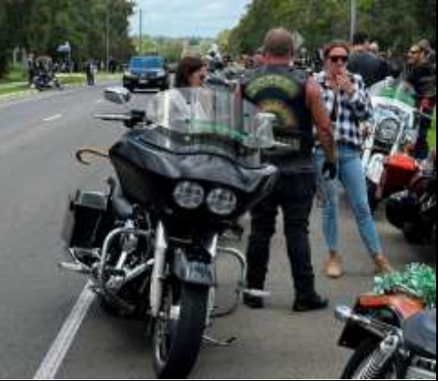
Regrouping at Tooth Street #3