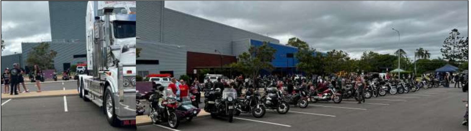
Fraser Coast Toy Run #1