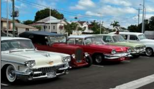
Some of the cars at the 2021 Toy Run