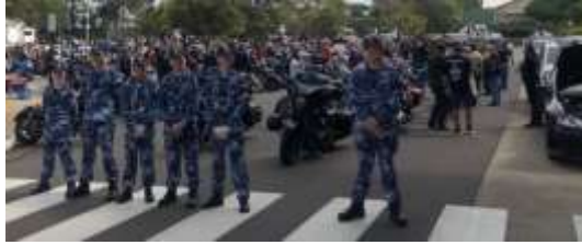
Airforce Cadets Standing Guard