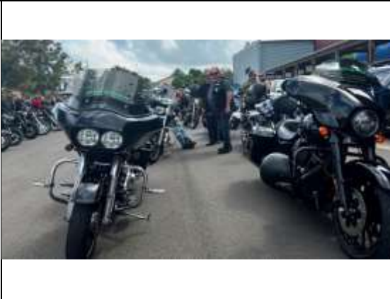
Diggers Military MC Lead out Toy Run 2021 #1