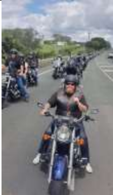
All smiles through Craignish