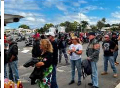
Some of the people at the 2021 Fraser Coast Toy Run