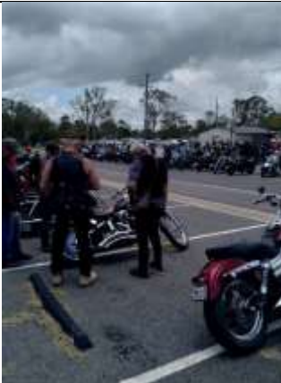
Last Stop Hervey Bay Sports Club #1