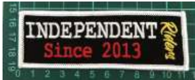
Rider Patches 2013-2020