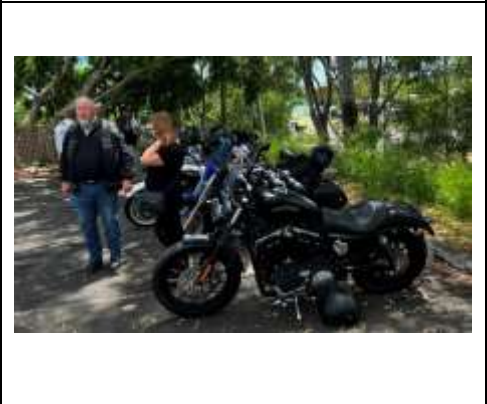
Day Ride 19 th December #3