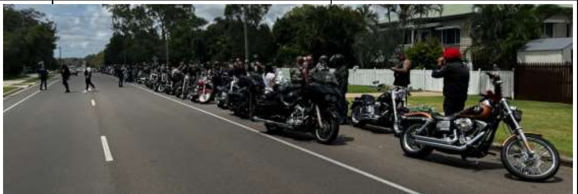
Regrouping at Tooth Street #4