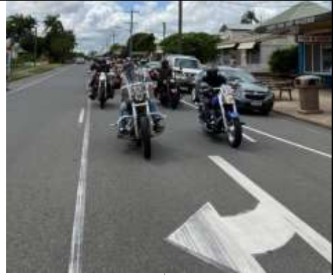
Heading up Walker St Maryborough