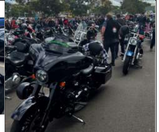
Diggers Military MC Lead out Toy Run 2021 #2