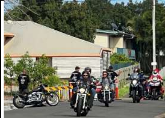
More bikes coming in – Fraser Coast Toy Run #2