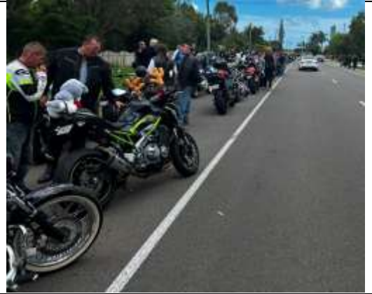
Regrouping at Tooth Street #2