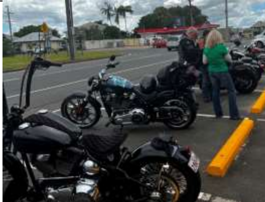
Day Ride 19 th December #2