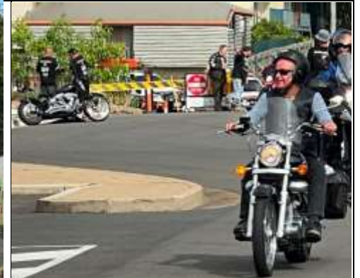
More bikes coming in – Fraser Coast Toy Run #3