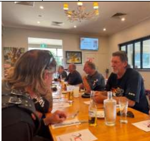
Lunch stop at Coroooy – 3 rd May #2