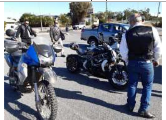
Gentleman's Ride 23 rd May– Capricorn Coast #5