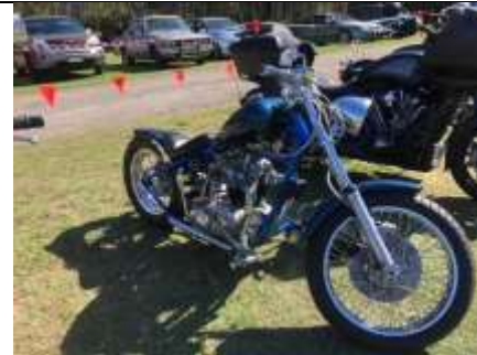
Excellent display of cars and bikes #5