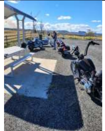
Out and about on the Frasse Coast #5