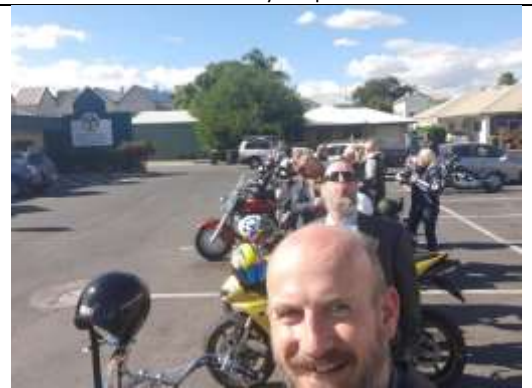
Gentleman's Ride 23 rd May– Capricorn Coast #2