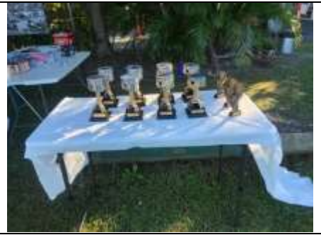
The trophies on offer