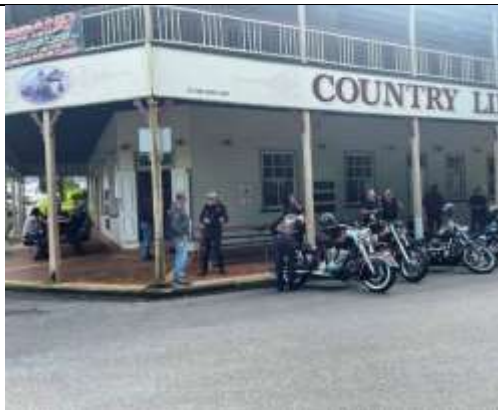
Day Ride 3 rd May – Kin Kin #2