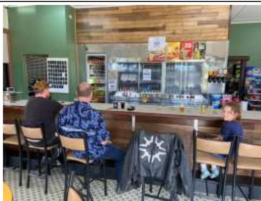
Out and about 8 th May– Capricorn Coast #2