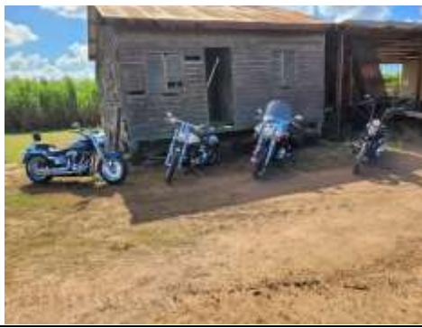
Out and about on the Frasse Coast #2