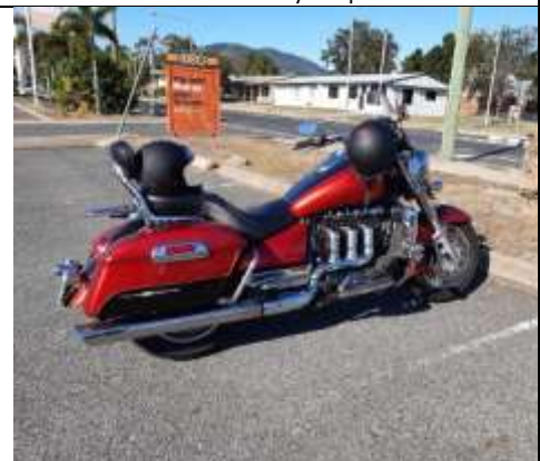
Gentleman's Ride 23 rd May– Capricorn Coast #9