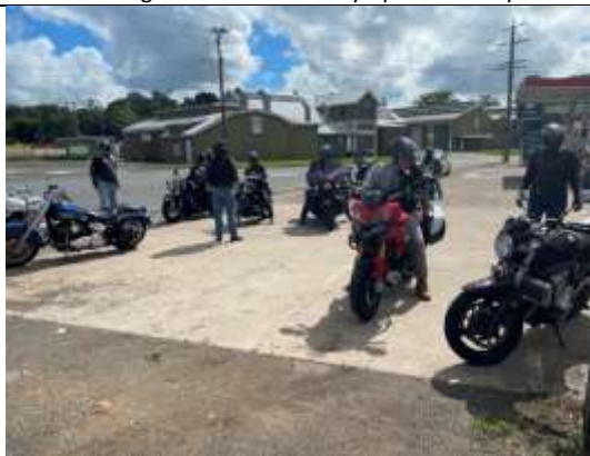
Day Ride 3 rd May - Pomona