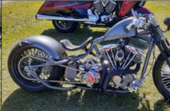
Excellent display of cars and bikes #8