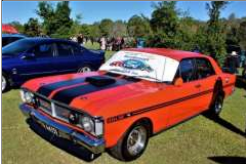
Excellent display of cars and bikes #4