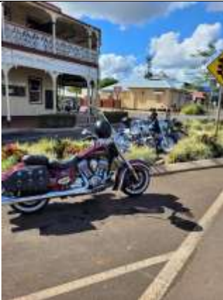
Lunch at Bucca 18 th April #1