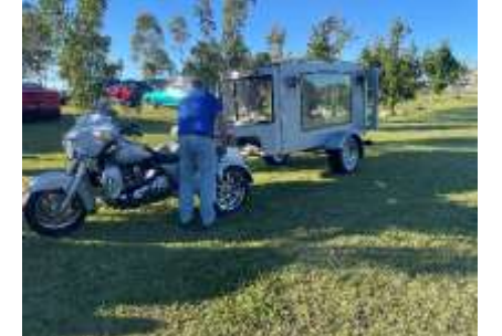
Excellent display of cars and bikes #3