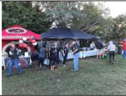
MACE and Independent Riders Stalls