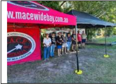
Setting up stalls the day before

8 TH ANNUAL SHOW AND SHINE MAY 16 TH 2021 (Fraser Coast)