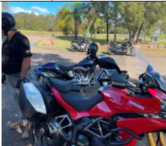
Homeward bound – Regrouping at Widgee #1