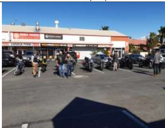
Gentleman's Ride 23 rd May– Capricorn Coast #8