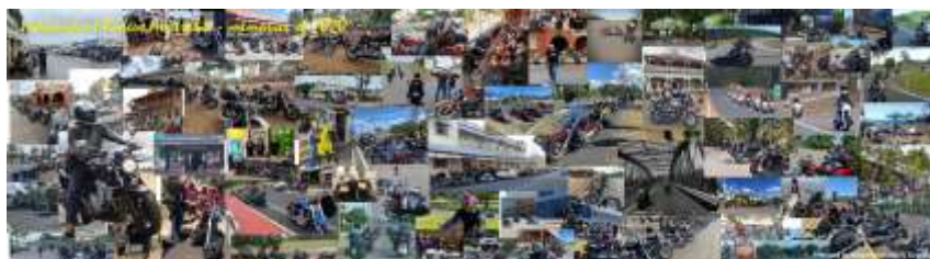
Banner example above 2.6x1 metre (approx.). $75 plus postage