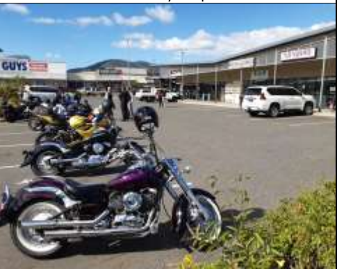
Gentleman's Ride 23 rd May– Capricorn Coast #3