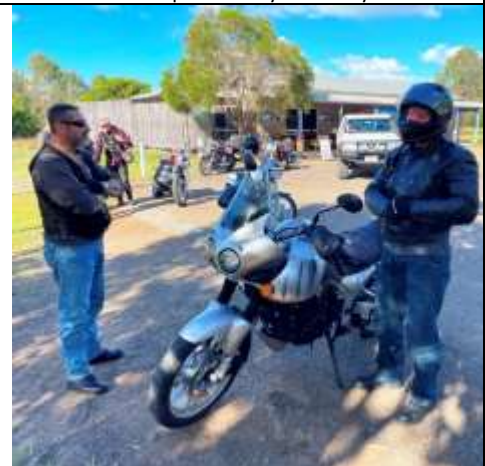
Homeward bound – Regrouping at Widgee #2