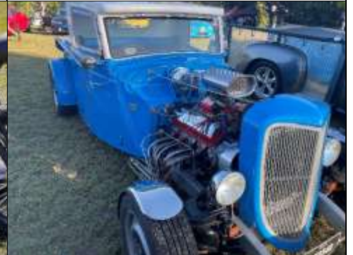
Excellent display of cars and bikes #9