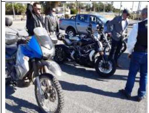
Gentleman's Ride 23 rd May– Capricorn Coast #1