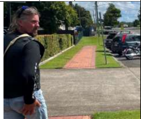
Lunch stop at Coroooy – 3 rd May #1