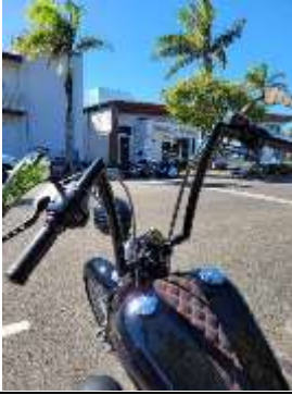
Out and about on the Frasse Coast #1

OUT AND ABOUT ON THE FRASER COAST – 23 RD MAY 2021