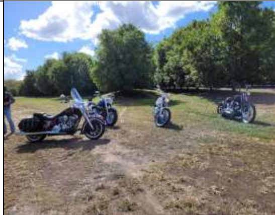
Out and about on the Fraser Coast #