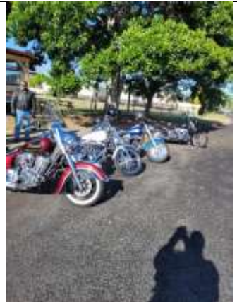
Last beers at Miners Arms #1