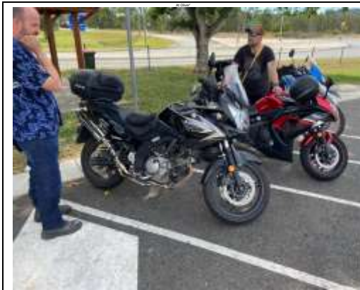
Out and about 8 th May– Capricorn Coast #1