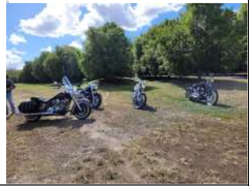
Out and about on the Frasse Coast #3