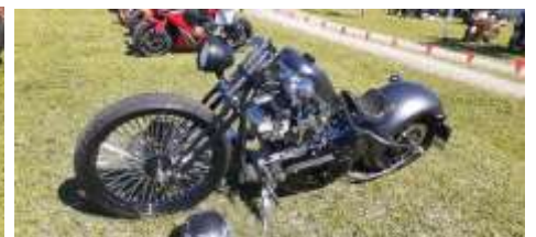
PIC #1, 2 & 3 Cars and bikes on display at the Independent Riders 2021 Show and Shine