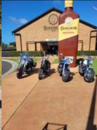
A visit to the home of Bundaberg Rum