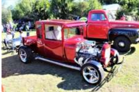
Excellent display of cars and bikes #2