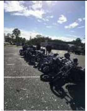
3 rd May Independent Ride – At Puma Sth M/B #3