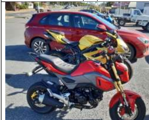
Gentleman's Ride 23 rd May– Capricorn Coast #7