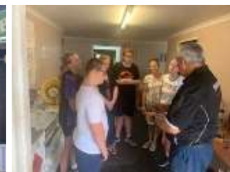
New Workshops and store front – 276 Kent Street Maryborough 4650

Many people on the Fraser Coast Region are struggling with reading, writing and maths. Independent Riders Workshops, offer literacy and numeracy classes, open to all ages including adults. We have a teacher who is available most days to run classes. Don't be shy, come in and give it a go. We are here for our community.