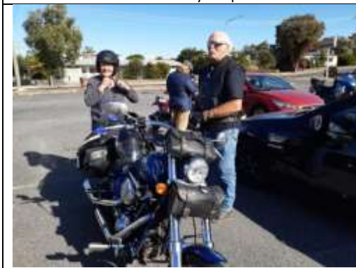
Gentleman's Ride 23 rd May– Capricorn Coast #4