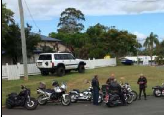
Waiting on riders back of Gympie – 3 rd May