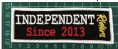
Rider Patches 2013-2020