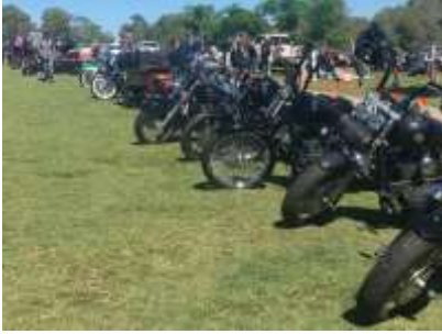
Excellent display of cars and bikes #1