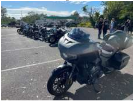
3 rd May Independent Ride – At Puma Sth M/B #1