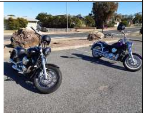
Gentleman's Ride 23 rd May– Capricorn Coast #6