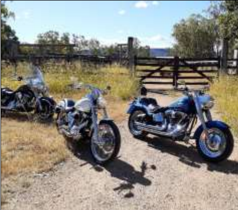
Out and about on the Frasse Coast #4