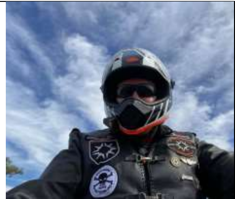
Out and about 8 th May– Capricorn Coast #3