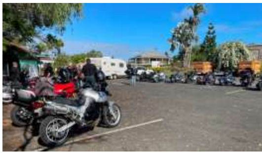
3 rd May Independent Ride – At Puma Sth M/B #2