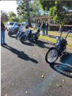
Last beers at Miners Arms #2