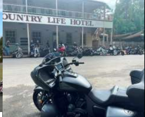
Day Ride 3 rd May – Kin Kin #1