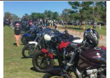
Excellent display of cars and bikes #6