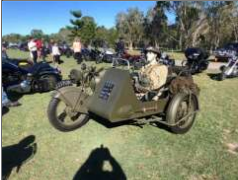
Excellent display of cars and bikes #7