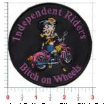
Independent Betty Boop Biker Bitch Patch (A3)