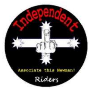
Protest Sticker (Round)