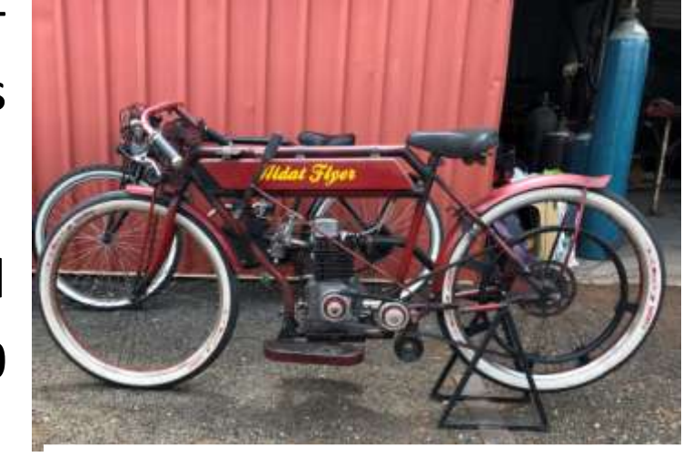
Other examples of bikes produced

For more info contact sales staff or ph. Sean Fisher 0408 193750